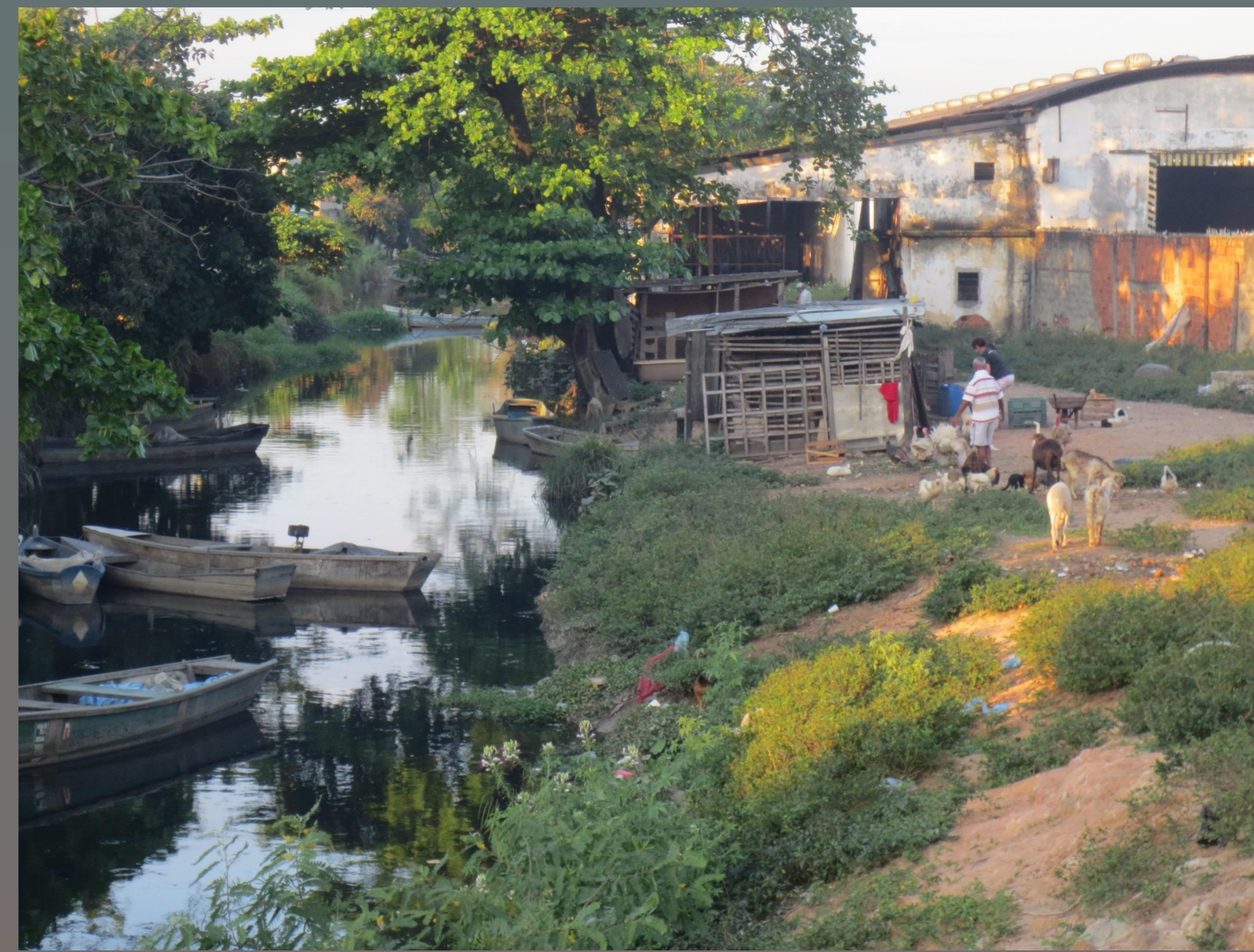
Neighborhood of Duque de Caxias, Rio de Janeiro, Brasil

Many of the foodborne parasites are associated with conditions of poor sanitation and hygiene and close contact with animals. The parasitic diseases disproportionately affect people of poorer communities due to these risk factors. There may also be impacts on long-term health due to chronic diseases and disability. The diseases have the potential to cause malnutrition, stunting, and mental retardation and thus decrease mental and physical potential, all contributing to the cycle of poverty.