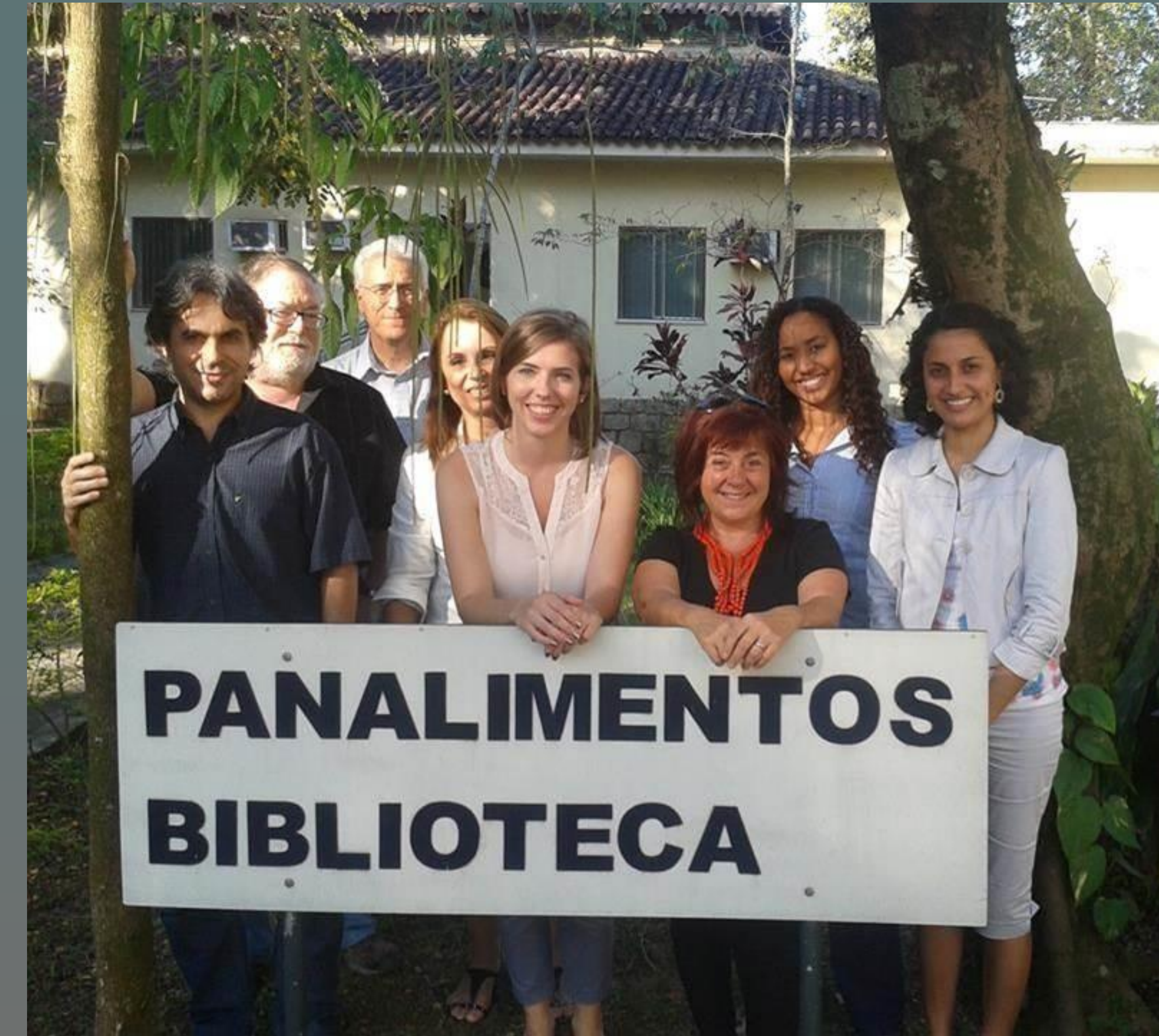
Food Safety and Library colleagues at PANAFTOSA